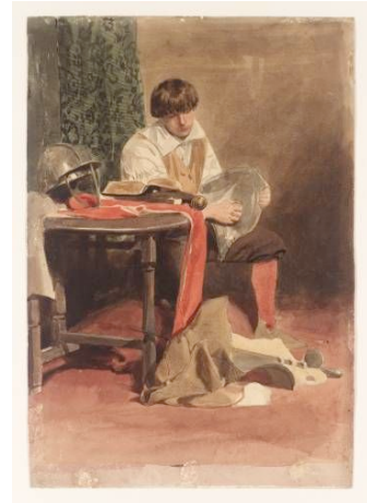
Charles Samuel Keene 1823-1891 Man Polishing Armour watercolour on paper