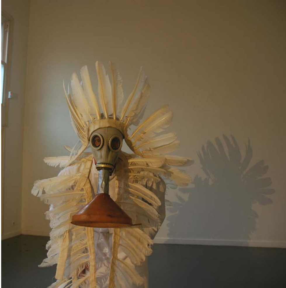
Toine Klaassen I am Clean Laboratory for Contemporary Archaeology mixed media 2006/07