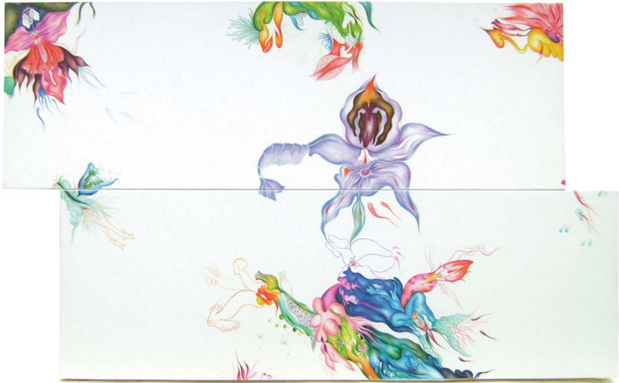
Yu-Chen Wang Tell No One 100x60cm colour pencil on paper mounted on MDF 2007