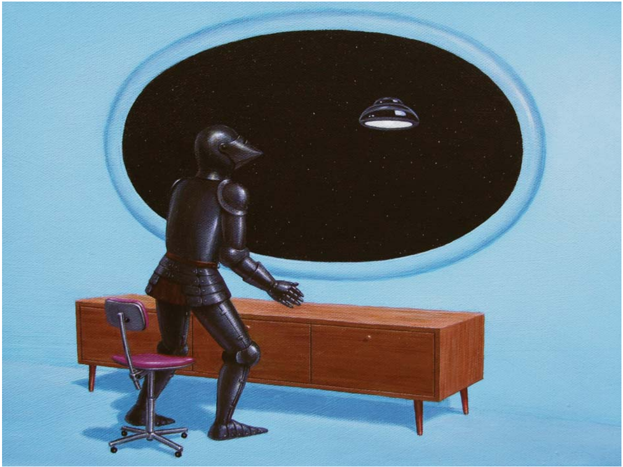
Andro Semeiko Holy Encounter 25x35cm acrylic and oil on canvas 2007