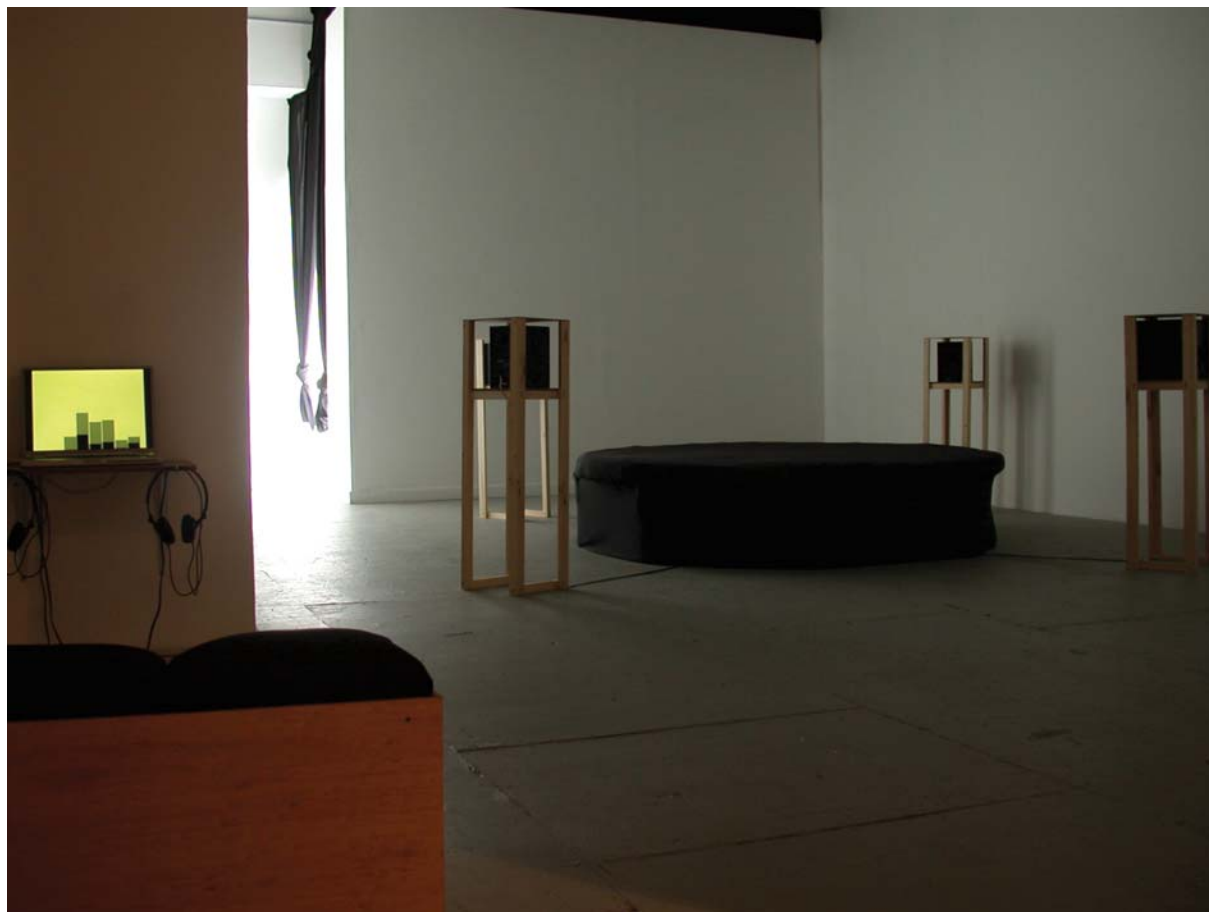
Clare Gasson Relay video sound installation (left) A Little Light Music sound installation As shown at Parker's Box, New York, 2006