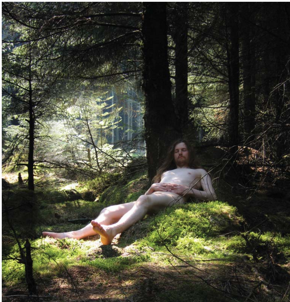
Cyril Lepetit Untitled Sleep video projection, loop Norway 2006